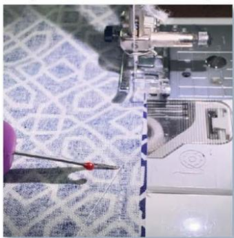
Step 6 - Continue sewing edges.