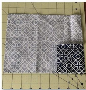
Step 3 - Position fabric.