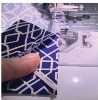
Step 5 - Sew edges and place tie.