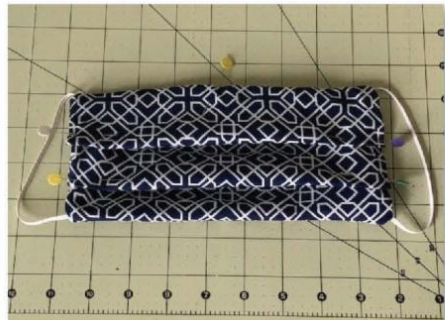
Step 9 - Make tucks to form pleats.