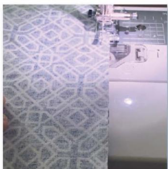
Step 4 - Sew to first corner.